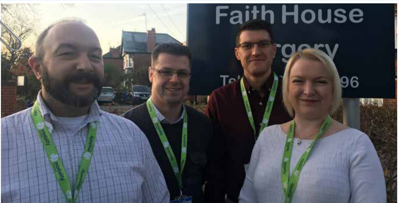
Home Visiting Team, Modality, Hull

"We don't just offer care and treatment but we are a friendly face, offering reassurance and make sure the patient is getting the most appropriate service. I feel very much part of the team - it's about having the person with the right skills, at the right time, and in the right place to give the most appropriate care for the patient."